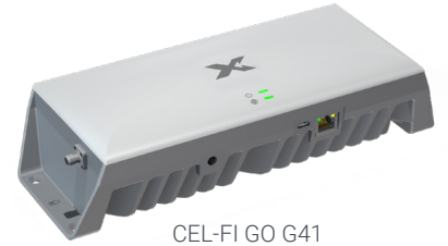
CEL-FI GO G41

Designed to solve cellular coverage challenges for indoor environments, the CEL-FI GO G41 is the most powerful carrier-grade solution in its class. Providing up to 100 dB gain, GO G41 is powered by the latest 4th generation Nextivity proprietary IntelliBoost chip to deliver reliable 2G, 3G, 4G, and 5G voice and data performance. GO G41 also supports 5G NR operation for seamless network migration and consistent connectivity. Plus, GO G41 is network safe and can be installed within minutes.