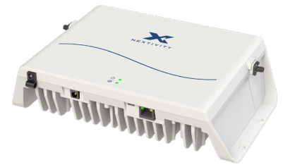
CEL-FI GO G51

Bringing the power of the macro 5G network indoors, CEL-FI GO G51 solves coverage challenges for the shorter range of mid-band 5G NR. The system delivers industry-leading signal gain up to 100 dB to overcome mid-band 5G NR coverage challenges that no other solution can. In addition to unmatched performance, GO G51 is compact, easy to use, and does not require manual configuration, making it easier than ever before for building owners to equip their buildings with 5G connectivity and ensure better voice quality, 5G data speeds, and fewer dropped calls. GO G51 is perfect for small- to medium-sized buildings, operator-approved, unconditionally network safe, and offers the flexibility to support various 2G/3G/4G and 5G cellular networks.